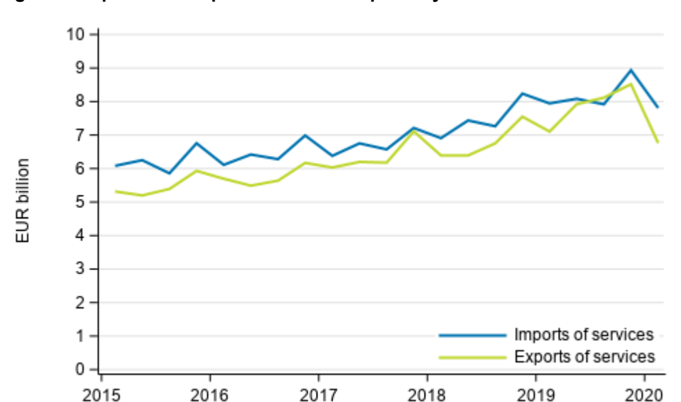
Figure 1. Imports and exports of services quarterly

Service exports fell by 5 per cent in the first quarter of 2020 compared to the corresponding quarter in 2019. Service imports decreased by 2 per cent. Exports of services amounted to EUR 6.8 billion and imports to EUR 7.8 billion. Service exports and imports decreased particularly due to decrease in travel and transport services. The data appear from Statistics Finland's statistics on international trade in goods and services, which are part of <u>balance of payments</u>.