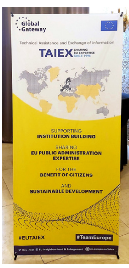
The EU TAIEX event centred around supporting reform processes on data management and governance in Mongolia.