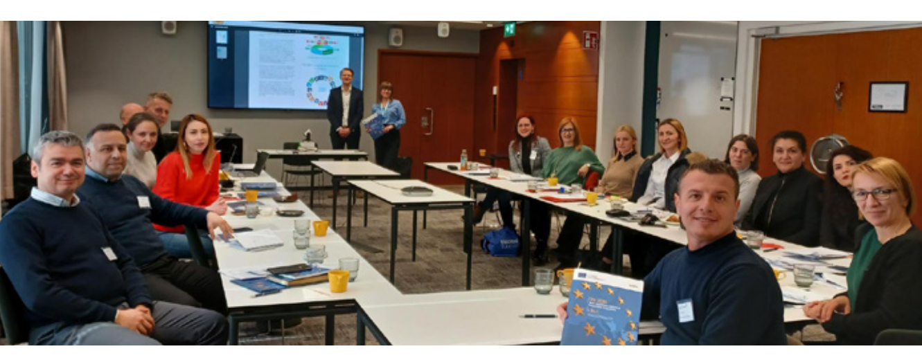
Workshop on environmental accounts taking place in Helsinki in May 2023.

Statistics Finland experts conducted technical assistance missions in Bosnia-Herzegovina and Kosovo. We also organised and hosted a regional workshop attended by fourteen participants from Western Balkan countries and Türkiye.