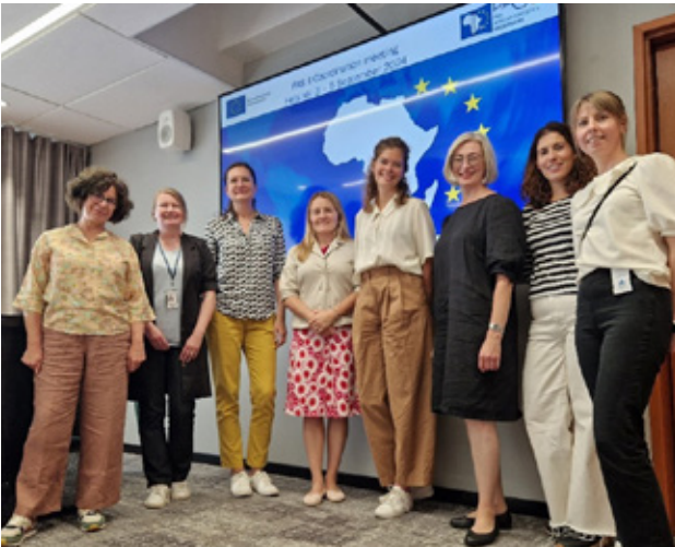
Representatives from INSEE France, Statistics Poland, Statistics Denmark, INE Spain and Statistics Norway attended the PAS II projects coordination meeting hosted by Statistics Finland in September 2024.