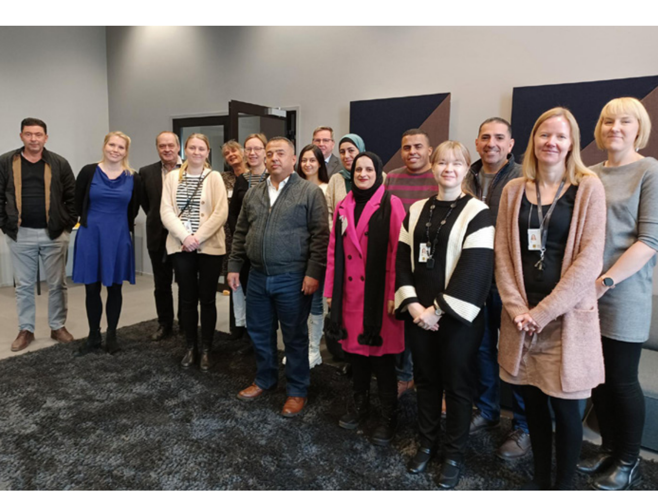
The development of the SBR being essential to integrating different data sources was a key takeaway from the study visit to Statistics Finland that took place in October 2023.

Statistics Finland has participated in the Twinning Project by consulting on building the national statistical register(s): SBR, Population register and Address register as well as standardised data and metadata. It has introduced some best practices for the National Data Centre aiming to provide data to all users groups according to their need and detailed microdata allowing decision makers to carry out detailed analyses. Furthermore, in the context of ensuring constant and reliable data sources and robust statistical systems that contribute to timely and informed policy making, Statistics Finland's experts contributed to developing PxWeb as a tool for dissemination of statistics and economic surveys.