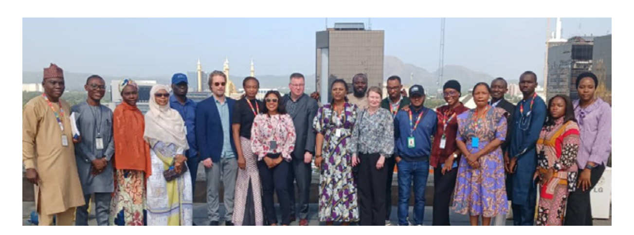
Key focus areas in the training held in October 2024 consisted of developing and maintaining the Statistical Business Register and innovative methodologies such as machine learning (ML) for processing large datasets and integrating multiple data sources to produce statistics.