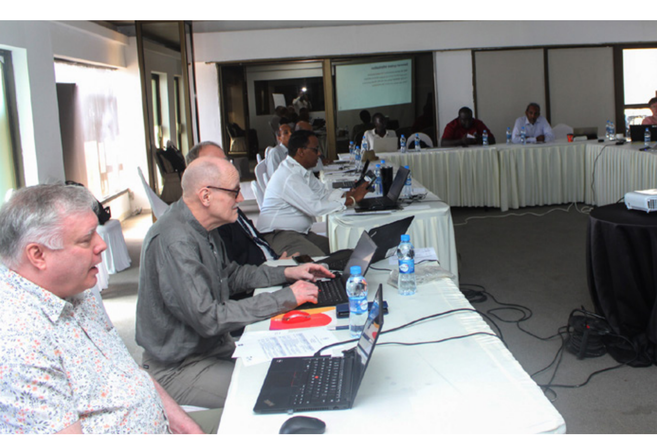
Px Training for IGAD: Statistics Finland experts giving training in dissemination course for the Regional Economic Community IGAD in March 2023.

As an example of Nordic cooperation leading to more joint work consultants from Statistics Finland carried out a training workshop in March 2023 on a dissemination platform for the Regional Economic Community IGAD with the focus on the PxWeb dissemination system in the frame of the Swedish international development project. Moreover, Statistics Finland's experts conducted two missions in 2024 to support the Kenya National Bureau of Statistics in the development of satellite accounts for household production with teams from Sweden and Finland working together.