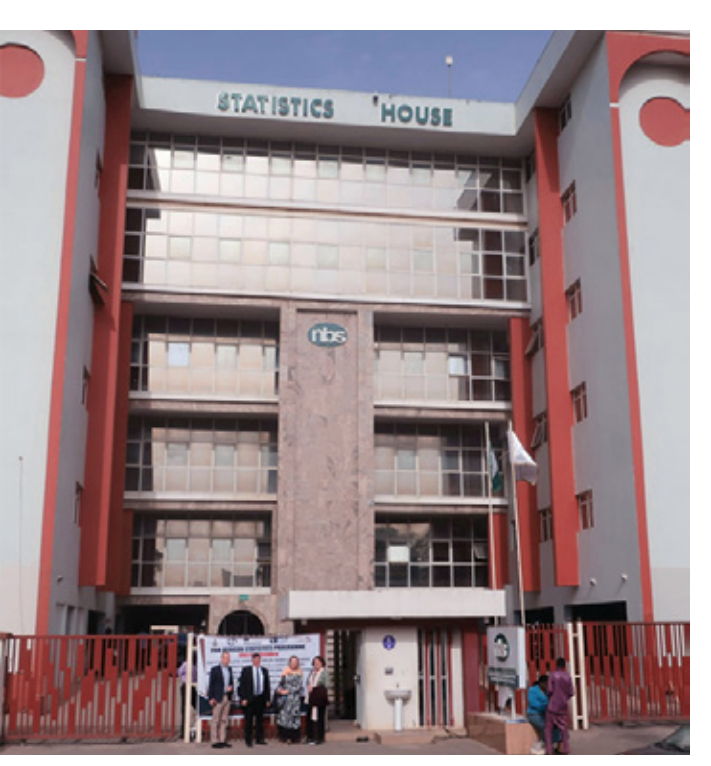
In the workshop held at Statistics House in Abuja in February 2024 valuable insights for future improvements were gained with regard to approaches in collecting administrative statistics data as well as leveraging technology like big data and web scraping.

The training workshop in February 2024 focused on harnessing administrative data, experimental statistics and effective data ecosystems. Presentations