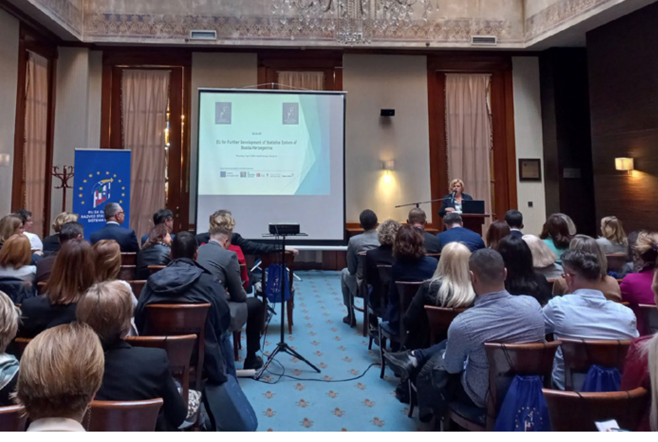
Kick-off event of the Twinning Project in Sarajevo in April 2024.