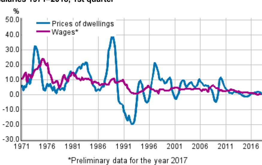
Figure 1. Year-on-year changes in prices of dwellings and in wages and salaries 1971–2018, 1st quarter

Over the same time period changes in wages and salaries have been more moderate than changes on the housing market, except for the mid-1970s, when the earnings level rose by over 20 per cent per year due to the great inflation. Over the 2000s wages and salaries have gone up yearly by an average of 3.2 per cent. The average annual rise in prices of dwellings has been about 0.5 percentage point faster, which has undermined the purchasing power of wages and salaries on the housing markets.