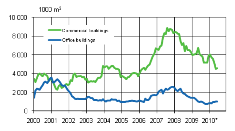
Appendix figure 2. Office buildings (sliding annual sum)