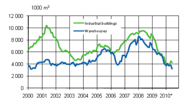
Appendix figure 3. Industrial and warehouses (sliding annual sum)