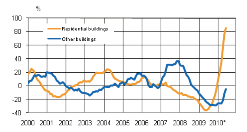
Appendix figure 4. Volume index for newbuilding 2005=100, annual change %