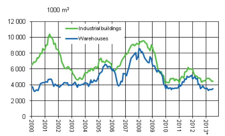
Appendix figure 3. Industrial buildings and warehouses, variable annual sum